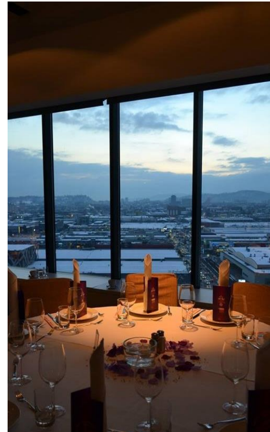
GALA DINNER WITH A VIEW