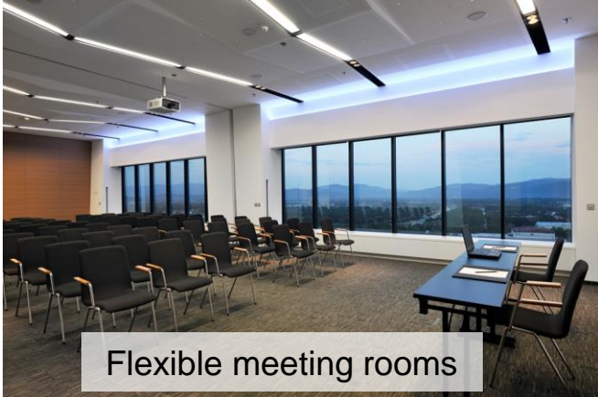
Flexible meeting rooms