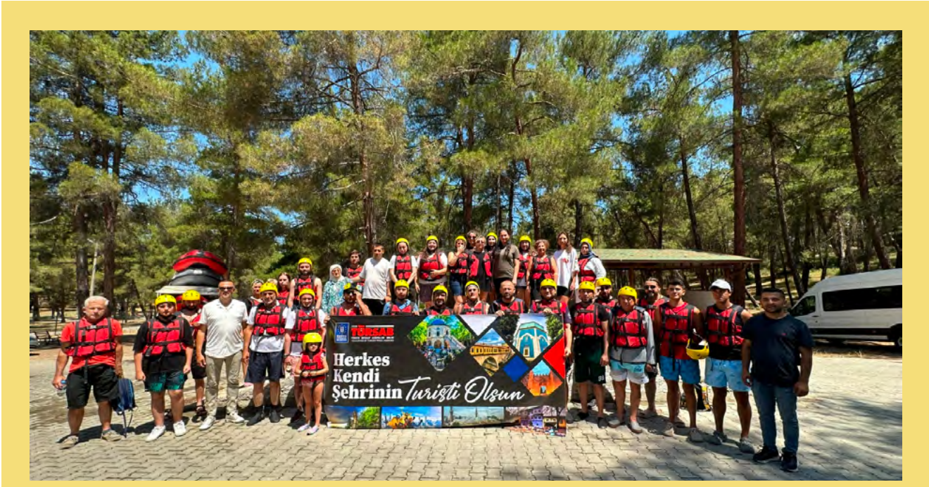
SOUTH MARMARA RRB ORGANIZED A RAFTING EVENT IN ORHANELI Our South Marmara Regional Representative Board organized a rafting activity in Orhaneli in cooperation with Bursa Tourism Promotion Association and Orhaneli Municipality. Sadağı Canyon and Orhaneli Women's Cooperative were visited during the trip, where the natural and tourism values of the region were introduced to the agencies in order to provide a new route for Bursa and increase the number of accommodation.