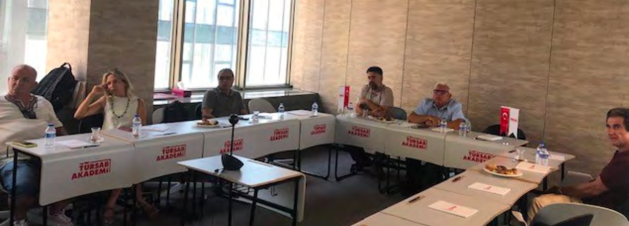
TÜRSAB CULTURAL TOURISM SPECIALIZATION PRESIDENCY MONTHLY MEETING WAS HELD The monthly meeting of the Cultural Tourism Specialization Presidency was

on festivals and promotional organizations organized by municipalities.